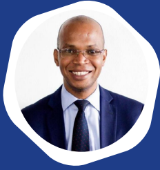
Hon. January Yusuf Makamba (MP) Minister for Foreign Affairs and East African Cooperation Government of The United Republic of Tanzania