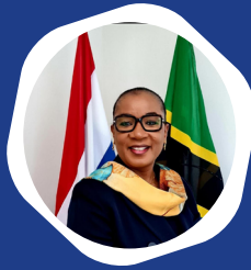
H.E. Caroline Kitana Chipeta Ambassador Embassy of The United Republic of Tanzania to The Kingdom of the Netherlands