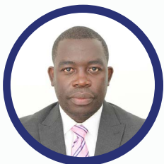
Hon. Chipoka Mulenga MP, Minister of Commerce, Trade and Industry Government of the Republic of Zambia